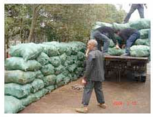
Vetiver to be transported