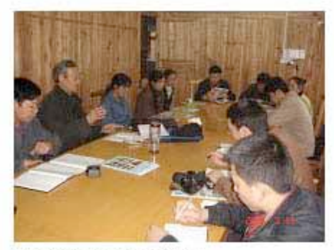
Discussion on nature disaster