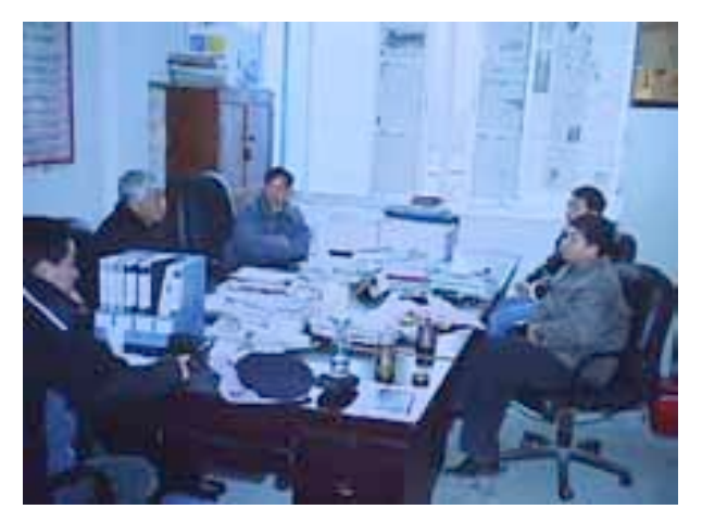
Group discussion at Environmental Station