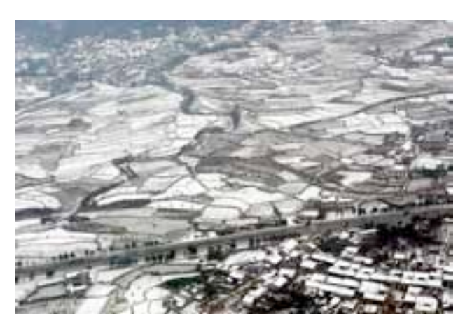
Fig. 1-2 Air-photo of Guilin taken on 3 February 2008.

The land was covered by both snow and ice particles (Fig.1 and 2). The roads were blocked. Farmers had difficulties with food, water, cloth, and electricity supply. Some trees and even houses were damaged or destroyed. Some tree seeding that was ordered for the project planting in 2008 was injured. Based on the investigation on 6 March the land preparation was completed only 87.13%. No any tree seedlings were