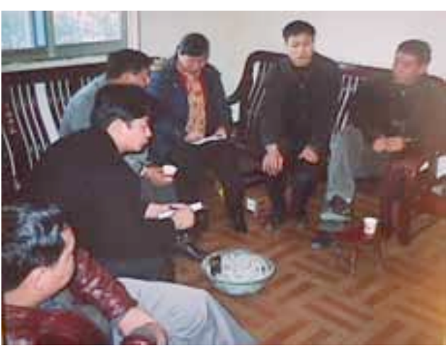
Discussion with farmers