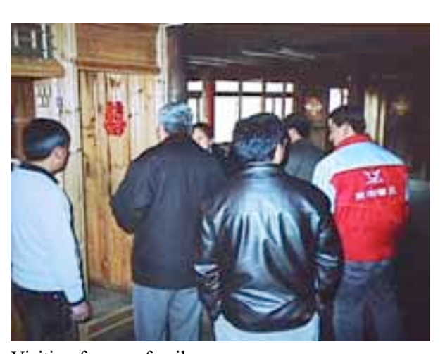
Visiting farmers family