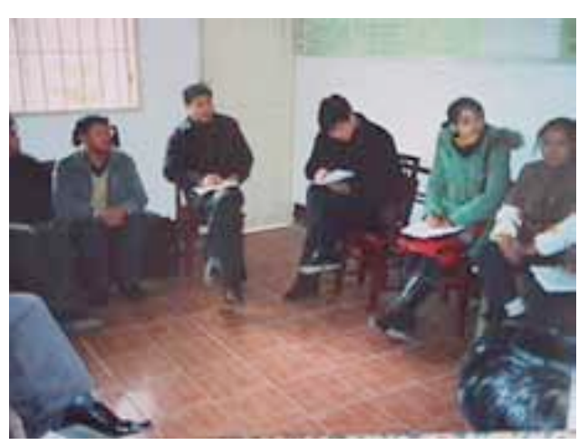
Discussion with Village Group