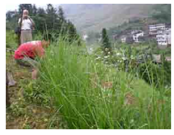
Vetiver hedges established