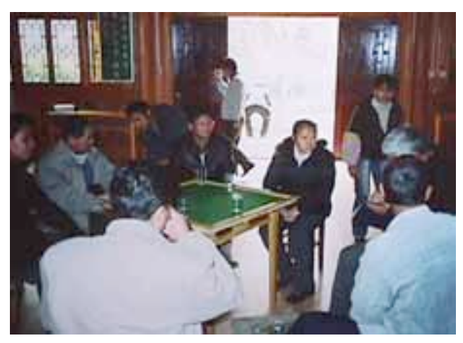
The woman Director discussing with farmers