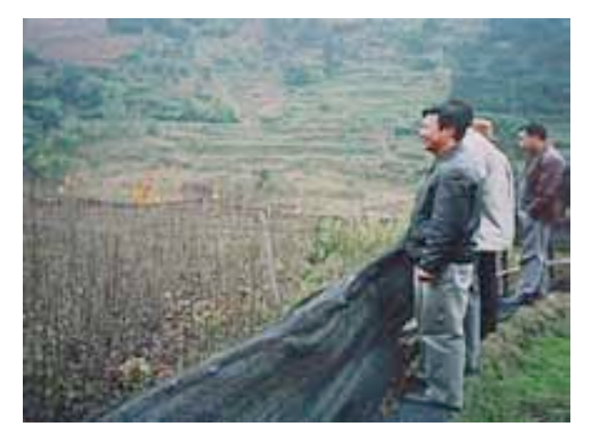
Investigate pear seedlings