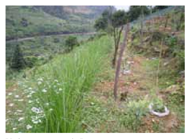
Vetiver protected Loquet- Lohanguo AF system