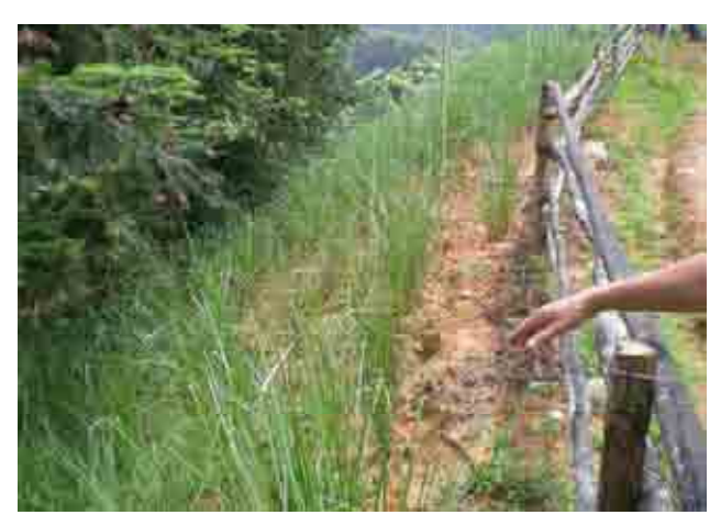
Slope was tentatively fixed in 80 days