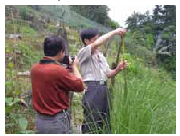
Vetiver up to 140cm in 80 days

During the visit, China Vetiver Network checked the distribution of fertilizers, discussed next step of the project, i.e. the construction of mini-irrigation systems. Request the local government to prepare detailed design based on the field survey on landform and land use patterns. Also, it is inquired that all original bills should be well kept.