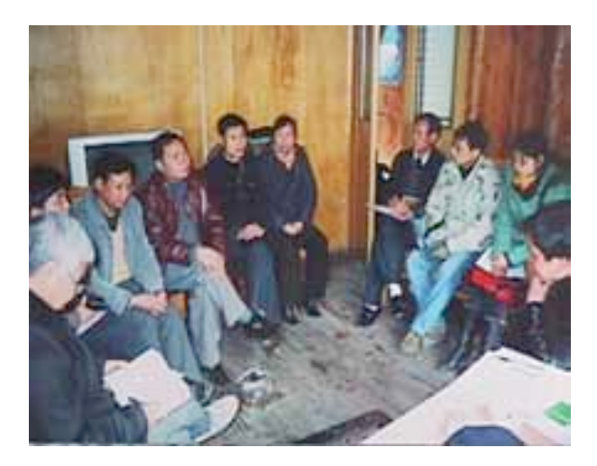
Talking to farmers