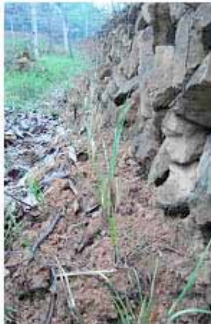
Pear tree planted