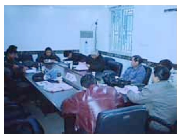
Meeting at the County Agri. Bureau