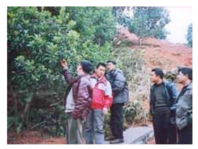
Investigate arbutus tree