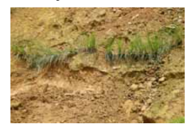
Vetiver stopped slope slide.