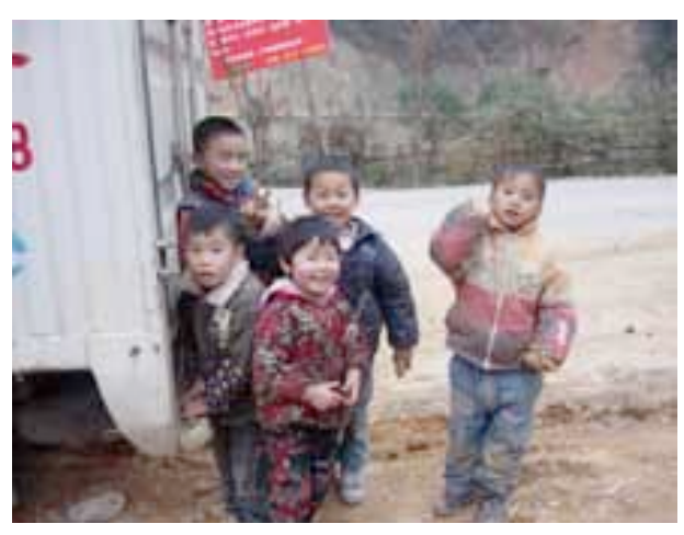
Children welcome the project team