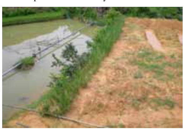
Vetiver protects fish pond