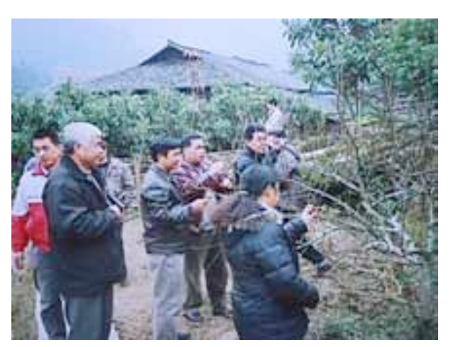
Observe pear tree at Batai Village